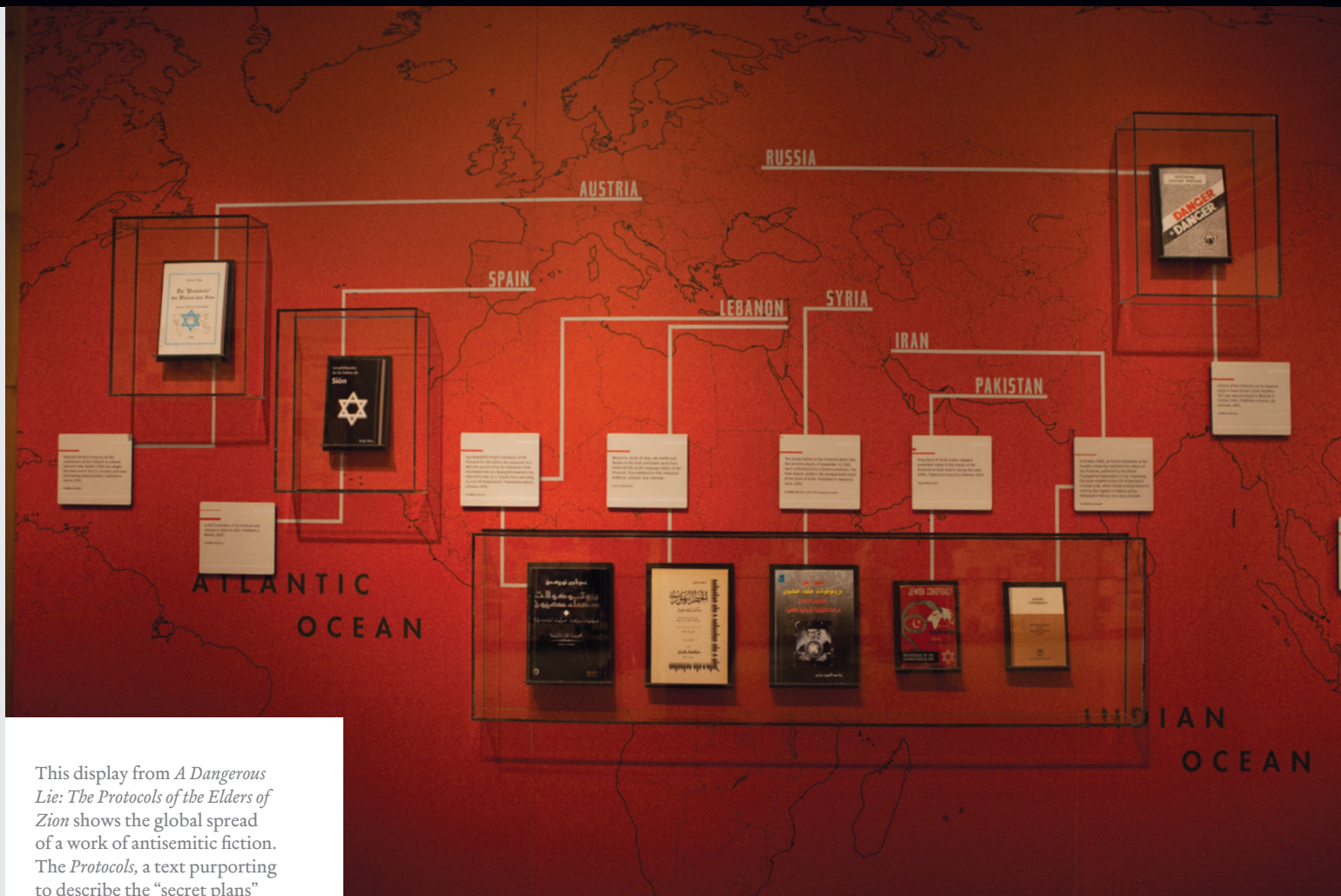
This display from A Dangerous Lie: The Protocols of the Elders of Zion shows the global spread of a work of antisemitic fiction. The Protocols , a text purporting to describe the “secret plans” of Jews to rule the world, has been repeatedly and thoroughly discredited, yet is still taught in many countries. The exhibition opened in the Museum’s Gonda Education Center in 2006.