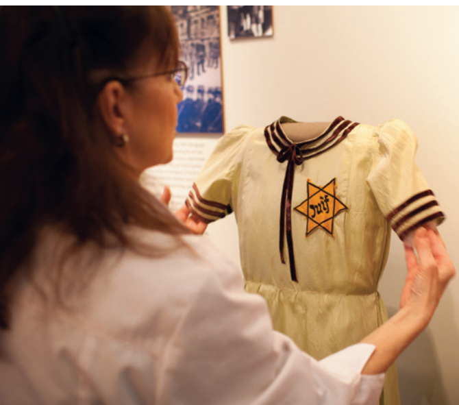
A conservator prepares an artifact display during the installation of Some Were Neighbors: Collaboration & Complicity in the Holocaust.

Contact midwest@ushmm.org or call 847.433.8099 for more information.